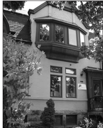
The Montreal Fluency Centre, which grew out of a private practice in Speech-Language Pathology, was established as a charitable organization in 1998, and moved to its present location in Westmount in 2006.

The Centre's activities include clinical research, the development of innovative treatments and workshops for professionals. It is the North American Clinical Training Site for the Lidcombe Program for Early Intervention in Stuttering.